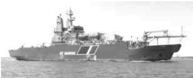
CS SOVEREIGN in the Solent

Then in 1995 ABP wanted the berth for container and ro-ro operations. As there remained a substantial period to the lease, C&WM negotiated very favourable release terms which enabled them to move the entire operation to Portland. With the STC factory being closed in the same period Southampton lost a type of vessel that had become a part of the scenery.