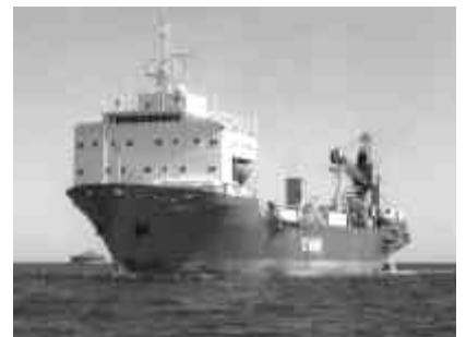
CS NEXUS off Ryde

It should be noted that for these five ships the "CS" was not a pre-fix but actually part of the name, a practice dating from 1969 when the GPO was formed and its cablesips became commercial vessels and not "HMTS", which produced a naming conflict with other vessels on the register.