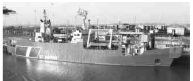
CS IRIS, left, and CS MONARCH, right, at 203 berth, Southampton