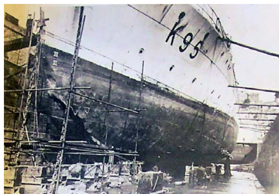
The damage sustained by Dianthus in the ramming of U.379

Only superhuman exertions saved the ship from foundering as the lower forrard messdeck, cable locker and forrard fuel tank were flooded. By carrying everything aft, including cable and anything else moveable, the ship's company managed to get the bows clear of the water by daylight. What that night was like only those present can know. There were nearly 300 men aboard, including some Greek survivors who offered to cut the German prisoners' throats, which they insisted would lighten the ship when the bodies were thrown overboard afterwards. DIANTHUS ' Commanding Officer said the best moment of the day was when he introduced the Captain of U.379 to the senior officer of U.210 .