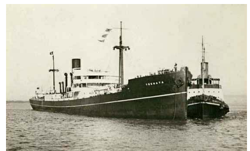
The Hain's ss Trehata was the Commodore's ship

Close by, three more ships were sinking and two more were drifting down the line out of control. Suddenly, somewhere in that convoy, one of the sinking ships carrying ammunition blew up! Few escaped unscathed as the thunderous, crashing roar deafened and disorientated all in the vicinity; the smoke obscured the daylight and the air was full of flying debris; we were stunned by the blast. Through it all plunged the surviving ships, belching smoke from their funnels, weaving and swerving to avoid sinking ships, wreckage and drowning seamen. Dante might have painted that inferno had he lived then.