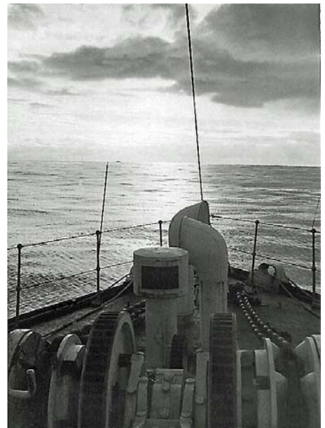
A sinister shape on the horizon, half a point to port.

Just as we were replenishing the upper deck stowage with ammunition, a yelp from the pom-pom gun's crew aft reported an even bigger and better submarine. Round went the ship. Bang went the gun. Down went the U-boat. Another yell from the masthead produced a third. We'd found the pack! Number three did not seem to have spotted us because he was obviously looking towards the way the convoy had gone and he was liberally plastered for his pains. The last shell landed smack on the place where his periscope was disappearing and I have always hoped he had to find his way back to Germany (if ever he did) without it. CHILLIWACK had been ordered to our aid and when she turned up we had a nice little hunt together, working the submarine over until 1023, when BROKE came up on the squawk-box to call us back because another four merchant ships had been sunk. There were a few comments about "all would now be well"!