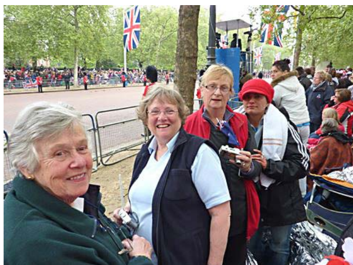
Ladies in waiting