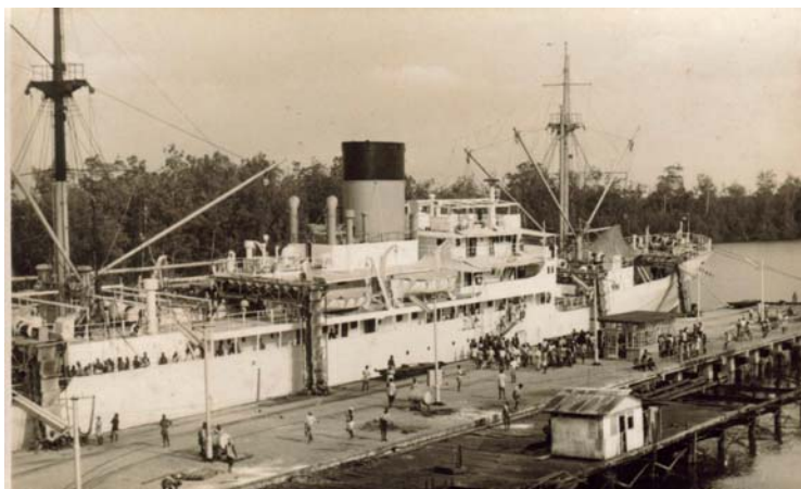
"Reventazon" loading at Tiko. Br. Cameroons 1956.

A cargo for Gothenburg always allowed time ashore to visit the four masted barque "Viking". She was the last Grain Race barque to discharge at Sharpness, and I have many photographs.