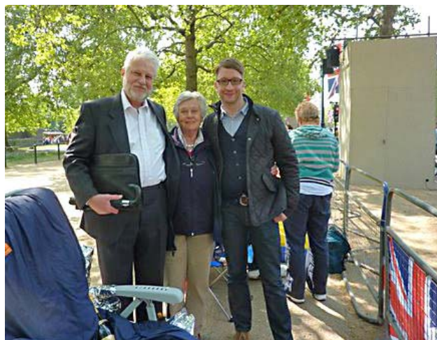
Welcome visitors on the Thursday