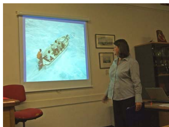
This slide shows the pirates close alongside