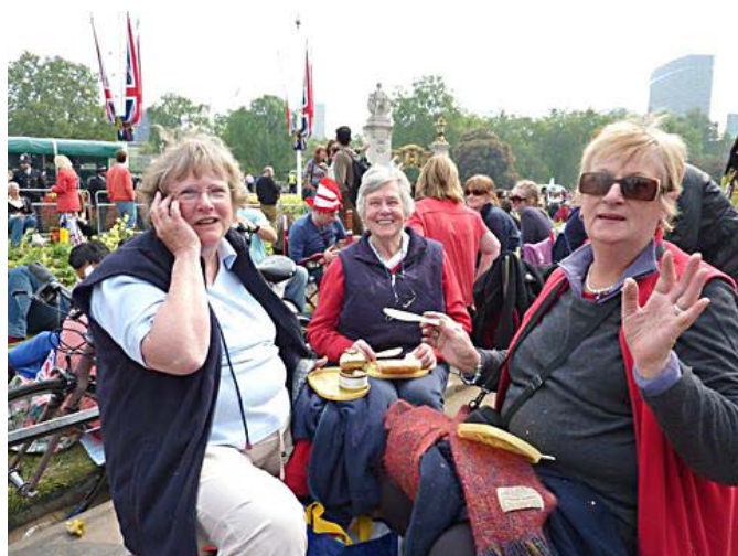
At last, the Wedding feast

A taxi to Wandsworth, champagne, supper, shower and bed ended a most wonderful few days. And now the preparations for the Diamond Jubilee have begun. All are welcome to join us for the River Pageant on 3 June 2012 - bring your own chairs, food and wine!