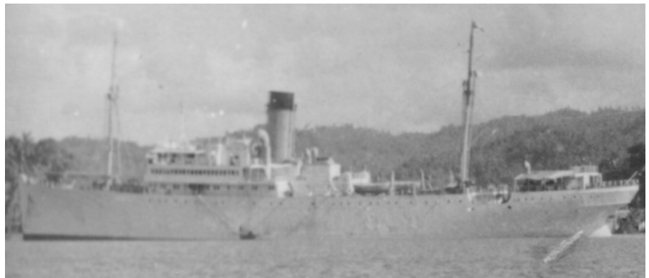
"Sulaco" anchored Port Antonio.

Our parent Company, which was the United Fruit Company of Boston Mass, were outsourcing their fleet to other flags. Three sister ships were transferred to the management of Elders & Fyffes and I served on two of them "Sulaco" and "Sinaloa" as second officer. They had been known as the "Great White Fleet", trading out of New York with passengers. Having suffered in looks following the removal of most of the passenger accommodation, they appeared elderly in design, but were steam turbo-electric powered vessels of 7600 grt with twin screws and a handy speed 17kts.