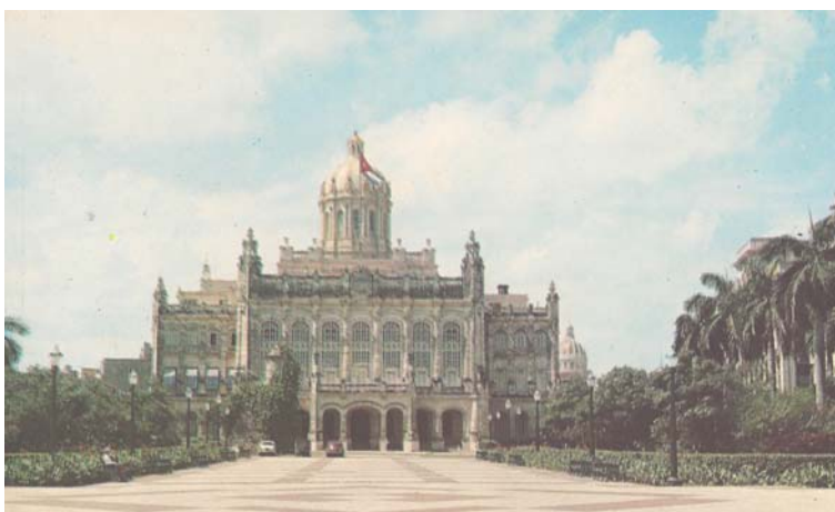
President Fidel Castro's Palace

There is a narrow gap in the cliffs with deep water, and this opens up into a very large bay with the jetty adjacent the town. Our time there was not enjoyable as all the seamen were continually being searched for cigarettes. One was even observed diving into the dock to escape bullets after some argument on the quay. Everywhere visited indicated poverty and the antique selection of cars or taxis had to be seen to be believed. Great caution was exercised as this visit was during the Bay of Pigs invasion at the Western end of the island.