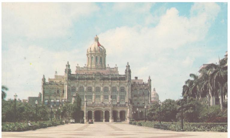
President Fidel Castro's Palace

There is a narrow gap in the cliffs with deep water, and this opens up into a very large bay with the jetty adjacent the town. Our time there was not enjoyable as all the seamen were continually being searched for cigarettes. One was even observed diving into the dock to escape bullets after some argument on the quay. Everywhere visited indicated poverty and the antique selection of cars or taxis had to be seen to be believed. Great caution was exercised as this visit was during the Bay of Pigs invasion at the Western end of the island.