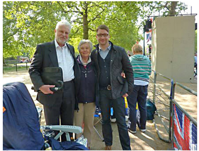
Welcome visitors on the Thursday