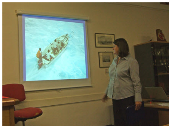
This slide shows the pirates close alongside