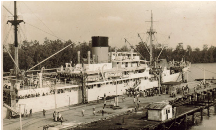
"Reventazon" loading at Tiko. Br. Cameroons 1956.

A cargo for Gothenburg always allowed time ashore to visit the four masted barque "Viking". She was the last Grain Race barque to discharge at Sharpness, and I have many photographs.