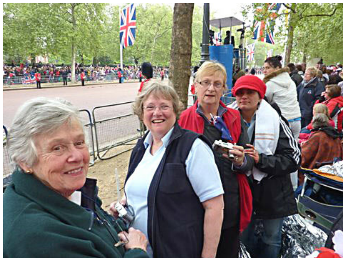
Ladies in waiting