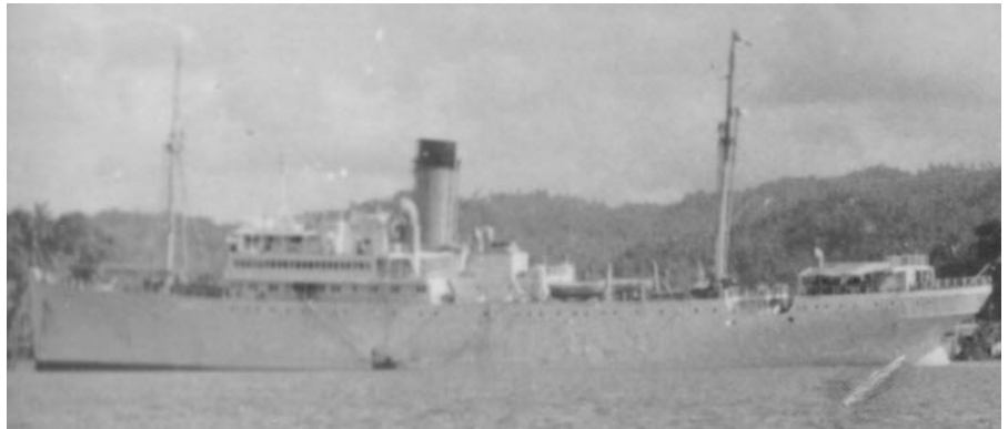
"Sulaco" anchored Port Antonio.

Our parent Company, which was the United Fruit Company of Boston Mass, were outsourcing their fleet to other flags. Three sister ships were transferred to the management of Elders & Fyffes and I served on two of them "Sulaco" and "Sinaloa" as second officer. They had been known as the "Great White Fleet", trading out of New York with passengers. Having suffered in looks following the removal of most of the passenger accommodation, they appeared elderly in design, but were steam turbo-electric powered vessels of 7600 grt with twin screws and a handy speed 17kts.