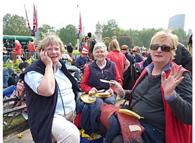
At last, the Wedding feast

A taxi to Wandsworth, champagne, supper, shower and bed ended a most wonderful few days. And now the preparations for the Diamond Jubilee have begun. All are welcome to join us for the River Pageant on 3 June 2012 - bring your own chairs, food and wine!