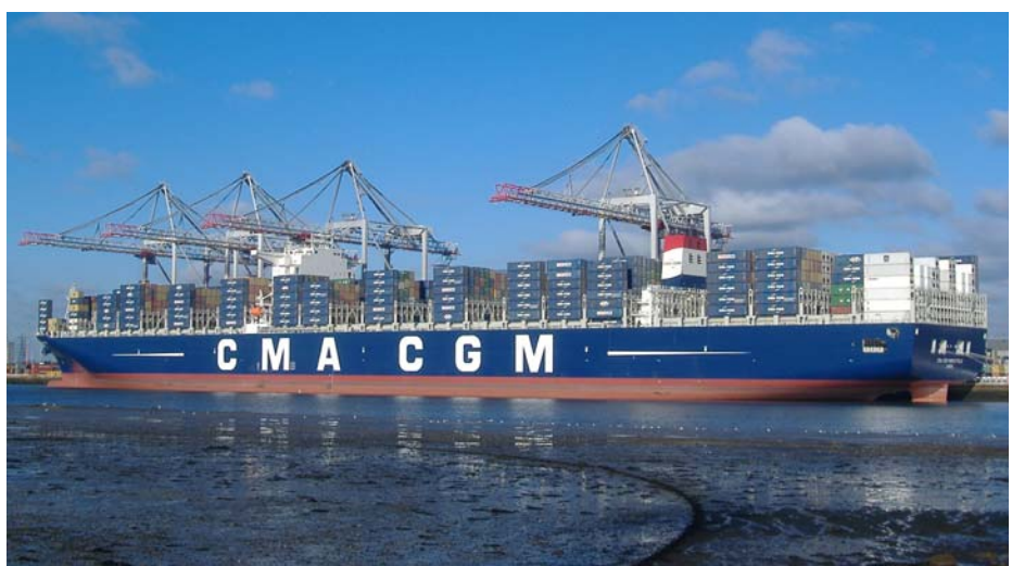
The Rubik's cube resolved?

The old Net Tonnage was a measure of each 100 cu ft of cargo space, so at 3609 the Brilliant would have 360,900 cu ft. The equivalent, on the Polo, will be the space in the containers but, although we are told that she has a capacity of 16,020 TEUs, there would seem to be no standard volume for a TEU! But a normal 20ft one is quoted as 1,360 cu ft (20 x 8.5 x 8) and if we do the sums it gives us a total volume