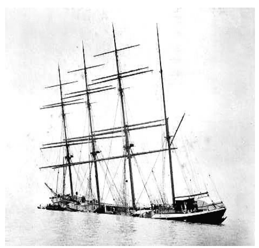
Daylight, sister ship of the Brilliant, caught fire out the fire and then raised and continued again. trading. She was finally broken up in 1954.

We lay at anchor off a small place called Yokkaichi, about eight miles from Kobe, as this was the place for discharging oil. The method used for discharging was, all cases were manhandled, not like a steamer using winches. From the deck into the hold, small stages were rigged, large enough to hold two men and a case of oil. The case was thrown from the lower stage up to each stage, and kept continually on the move, on deck it went down a slide, over the side into small sailing craft, the cleanest native craft I ever saw, with the Captain and family living on board all the time. They sailed ashore if there was a breeze, otherwise the Captain and his wife sculled with a large oar over the stern, with a rope attached to the loom end of the oar, different to our way of sculling.