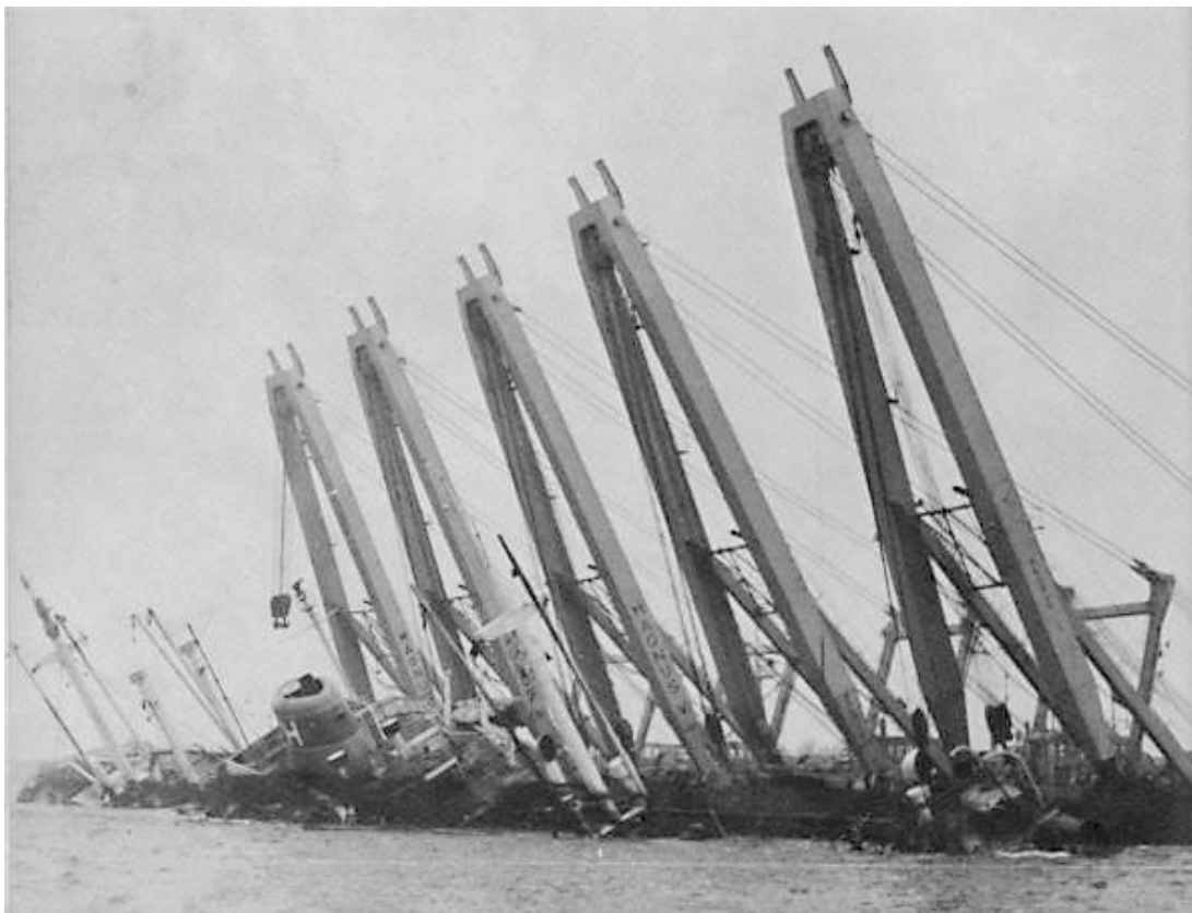
Parbuckling Hornland, Rotterdam Waterway 1969?

This should be a cause for concern. Though it will not matter if there is another war: our merchant fleet, which sustained us through two world wars, is now but a shadow of its former self, so we could be starved into submission within months.