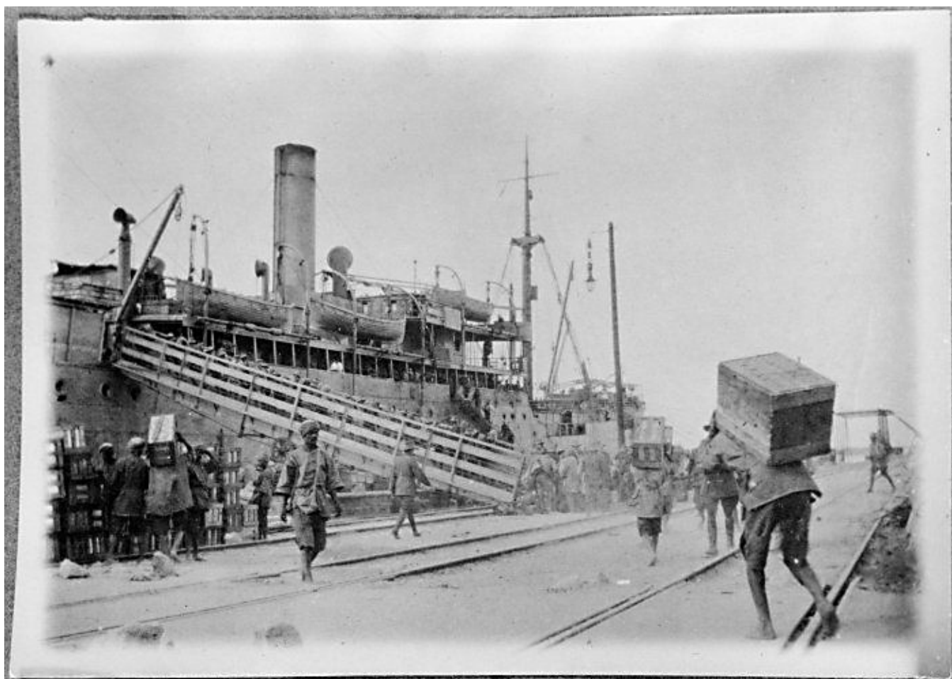
The only picture of the Huntscastle that could be found. She doesn't appear in the Union Castle ship list either. Built in 1902 as the Louisiana , she returned to the German East Africa Line in 1921 as the Sultan and was broken up in 1933

Unfortunately our Third Engineer died while we were there and, owing to the very hot weather, arrangements had to be made right away to get him buried. I informed the carpenter that the body measured five feet six inches, but being a Greek and not understanding much English, he made the coffin six feet five inches. In the meantime I had sent a party ashore to dig a grave, which was really only a hole in the sand. I hurriedly sent a man ashore and told them to make the grave longer, this being quicker than making the coffin shorter, as everything was ready for the funeral when I found out the mistake. The coffin was lowered into a lifeboat and a second boat towed it ashore. Half way from the boat to the grave, I realised the lowering ropes had been left in the boat and a man was sent hurriedly back for them. I slowed the funeral party down to a very slow walk, and the man caught up with us before we reached the grave, where our Captain was waiting to read the service. On the way back to the ship he congratulated me on the slow and reverent way in which we approached the grave. We never let on about the real reason for this. After all, we were professional sailors and not undertakers. We marked the grave with a wooden cross made out of two lengths of teak wood, used for keeping the horses apart in the holds, suitably inscribed by the carpenter with his mallet and chisel.