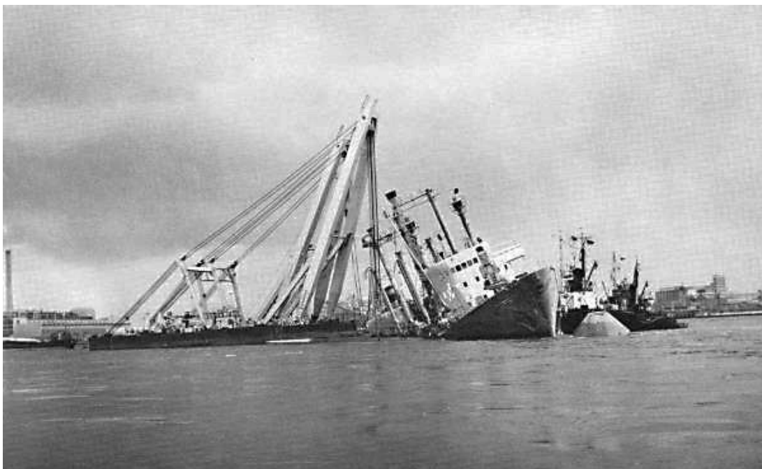
Parbuckling Magdeburg, Thames 1965

After the war it was agreed that Britain would never again leave itself without a salvage capability. The war-built units were put under Admiralty management, with some being bare-boat chartered to commercial firms. Risdon Beazley took two of the salvage ships and kept an enormous stock of salvage equipment at its Southampton base. The company also tried to venture into ocean towage, with a Bustler class tug, but were soon overtaken by various continental companies, who were able to work freely in Britain. Beazley went on to concentrate on salvage and wreck removal, plus cargo recovery.