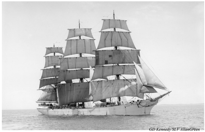
The Af Chapman, seen here under her previous name, GD Kennedy. She made her last voyage as a training ship in 1934 and is still in use as a youth hostel in Stockholm.

I recall one morning at daylight, seeing a full rigged ship anchored off the Needles, flying letter G, this flag denoting that the vessel flying it requires a pilot. As her draft was 16' 6", it was my place to board her. This I did and was