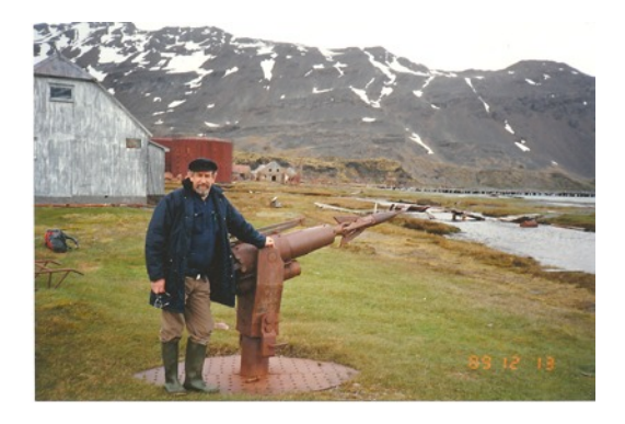
as a Harpooner and right, fit for a Christmas Card, Grytviken Church