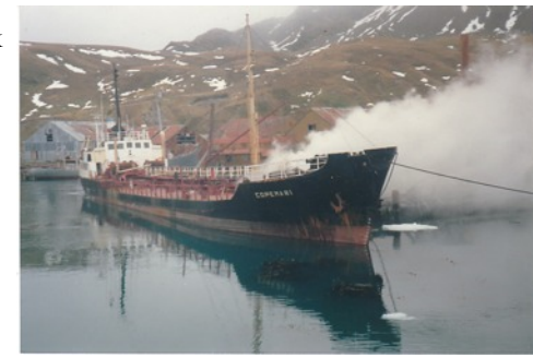
Copemar 1 steaming tanks

To carry out their work the team made temporary repairs to jetties, rail tracks and pipelines and dealt with bunkers in several of the abandoned catchers. In addition they entombed quantities of blue and white asbestos and large amounts of unused fibreglass in pressure vessels and oil tanks.