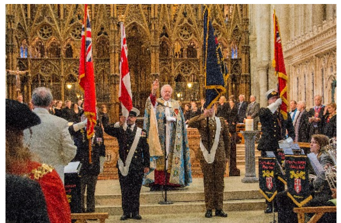
After the Doxology the Colours were returned to the Colour Party and blessed by the Dean