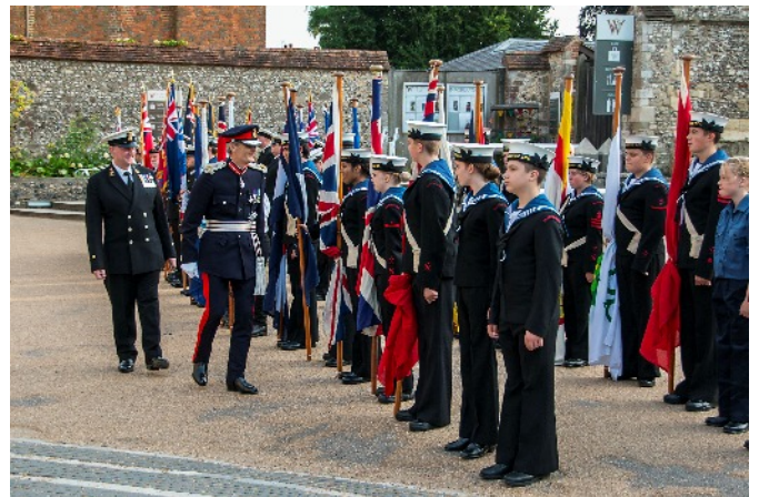
The Lord-Lieutenant inspects the cadets of the Flag Party