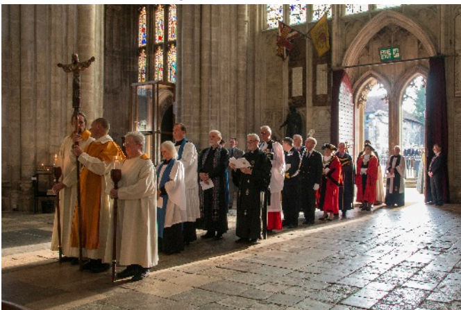
The Procession is assembled