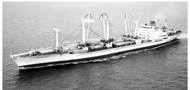
SA van der Stel

The SA van der Stel grounded on the Helen Mar in September 1982; surely one of the most attractive ships to come to grief there. Our team salvaged her and brought her into Singapore. With a full general cargo security became an issue; we were given a copy of the manifest and I started to guesstimate the value of the cargo. There was one significant exception - a parcel that had been loaded in Singapore, without a description. The agents couldn't, or wouldn't, give us answers. In my frustration I asked if they would accept that it was valued at US$1,000 per ton, my rule of thumb at the time; oh yes they said. We intended to base our security calculations on that: but there seemed to be a degree of relief on the SAFMarine side, without further ado they put up an open guarantee.