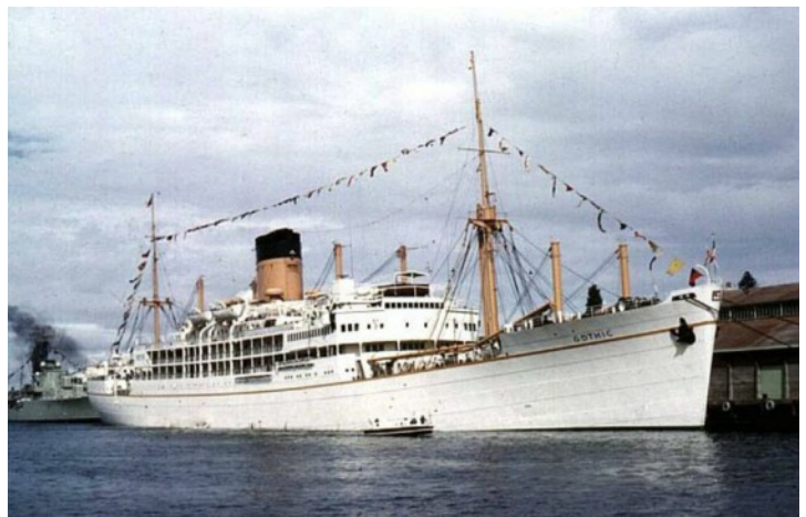
S.S. Gothic in Royal Yacht livery, in Hobart, Feb.'54

I found myself between the boat and the ship's side. In falling I had grasped a rope from the boat's deck as I went by and managed to hold on to it, but in the meantime I was being crushed between the two. I yelled out to the engine man and told him to go astern and back away from the ship. I could only just hear his reply, owing to the wind, as he said, "I don't know how to reverse, this is my first day in the boat." Eventually I was dragged onboard, a very difficult job as I had thick clothing on and it was saturated. I then recalled the words of the sailor on the tanker's deck,