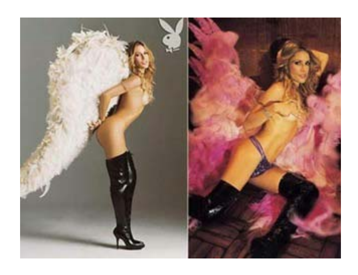
She is a Brazilian swimsuit, Victoria's Secret, and Playboy model.