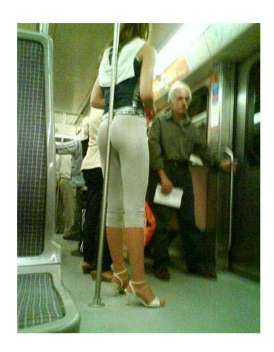
No, No, the older guy by the door!!!!