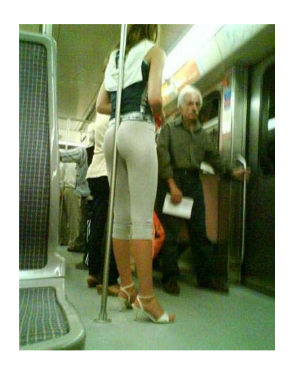
No, No, the older guy by the door!!!!