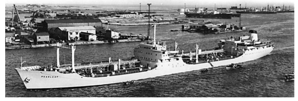
RFA Pearleaf before the beam replenishment derricks were fitted

After loading a full cargo of FFO in Trinidad we set our course for home (Portsmouth)! I was on the midnight to 0400 watch and had just picked up the Lizard Light when "Sparks" came into the bridge and said we have to proceed to Gibraltar immediately, orders will follow. We passed Gibraltar and were told to proceed to Aden and adjust our cargo as we were to support the carrier group off Beira. We had to adjust cargo as HMS Eagle was running low on avcat (aircraft