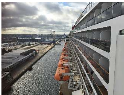
An empty quay greets the arrival of the QM2

It might be expected that with no passengers to carry there would be no passenger ships visiting the port. This couldn't be further from the truth. Those that are anchored on the south coast of England make regular visits to change personal and take on stores and bunkers. They also need to leave the anchorage so that they can discharge their grey water on passage. But there are no passengers and much reduced crews. It seems a little surreal to report to VTS that the Queen Mary 2 has only 135 on board- and a number of those are only on board because they can't get home. It seems even more surreal to look down on the wharf as we berth the ship. In normal times this will be bustling with personnel and forklift trucks as they ready themselves to unload the baggage of the departing passengers. It's sad to see an empty jetty with just a few linesmen to take the ship's ropes.