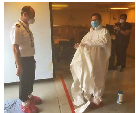
Boarding a passenger ship

Just like the response of each and every individual nation, it seems that every ship is dealing with the impact of coronavirus differently. It is at the very least ironic