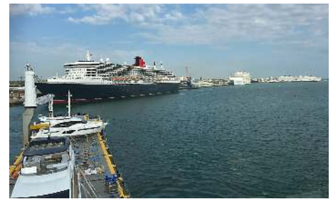
Full of cruise ships

There's no doubt that at the height of lockdown trade was down. One of the advantages to piloting in Southampton is the variety of different types of ships: tankers, containerships, car carriers and passenger vessels are the majority of our visitors but there's also a sprinkling of bulk carriers and specialist ships such as research vessels and the occasional military vessel. Usually when trade drops in one sector it will hold up in others. Coronavirus, as we are all too aware, has affected all sectors. There's been little demand for aviation fuel petrol so the refinery's need for crude oil and overall shipping movements have dropped. Most businesses were shut so the demand for the cargoes that are carried on car carriers was severely reduced. (Although generally referred to as car carriers, most of this type of vessel is more correctly described as PCTC – Pure Car and Truck Carriers. They can carry anything fitted with wheels or tracks. And, if it doesn't have wheels they can still carry it on special trailers). There was a small reduction in the number of containerships – most are on scheduled services. Of course, the virus has had the biggest impact on the cruise sector.