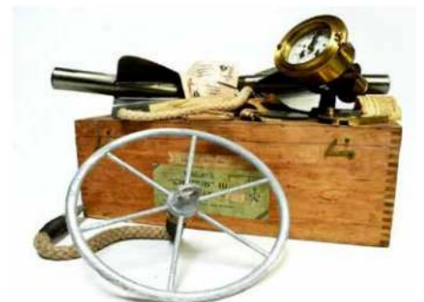
The Walker's "Cherub III" Taffrail Ship-Log

The box contained four principal items. First a bronze Rotator fitted with a short length of logline and a brass connector referred to by the manufacturer as a shell, but more commonly known for some obscure reason as a frog. There was