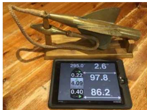
The old and the new