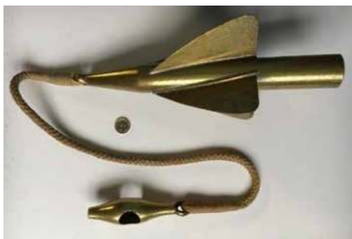
Rotator with shell/frog. (One pound coin to show scale)

space in the box for another rotator, but that was missing. We could only speculate as to the fate of the individual who had lost it. Like the Flying Dutchman, is there a ghostly cadet forever condemned to wander the oceans searching for the lost rotator?