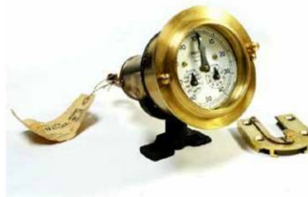
Log Register with Shoe Fitting

Forty-five years later, at the end of 2020, I piloted my last ship. After we'd berthed and as I was packing up my PPU (my Pilot's Portable Unit), it is perhaps predictable that I started thinking about the journey so far travelled – and not just the recently completed act of pilotage from boarding to berth. I was thinking about how I had changed and developed over the years, and, of much more importance to everybody else, how the industry had changed and developed over the same period. How, like the rest of the world, shipping has embraced the digital age. On my first ship, the attempt to measure the ship's speed was mechanical and highly inaccurate using equipment designed in the nineteenth century. Today, using either a differential GPS or Real-time Kinematic (RTK) signal, manufacturers claim a speed accuracy within 1 cm/sec. (Though of course the purists will argue that my PPU is measuring speed over the ground compared to the Walker log's speed through the water). Furthermore, the display component of my PPU, shows ground speeds in both a fore and aft direction and sideways, and, if preferred, it could show the athwartship speeds at both the bow and stern. For the younger me, the thought of having all that highly accurate information available in real time was unthinkable. The industry – and myself – have come a long way from the Walker "Cherub" III Taffrail Ship-Log.